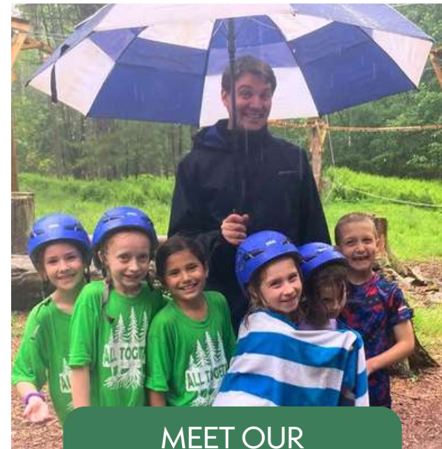
MEET OUR YEAR ROUND STAFF