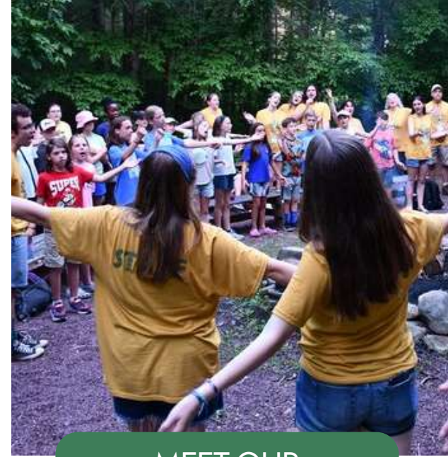
MEET OUR SUMMER STAFF